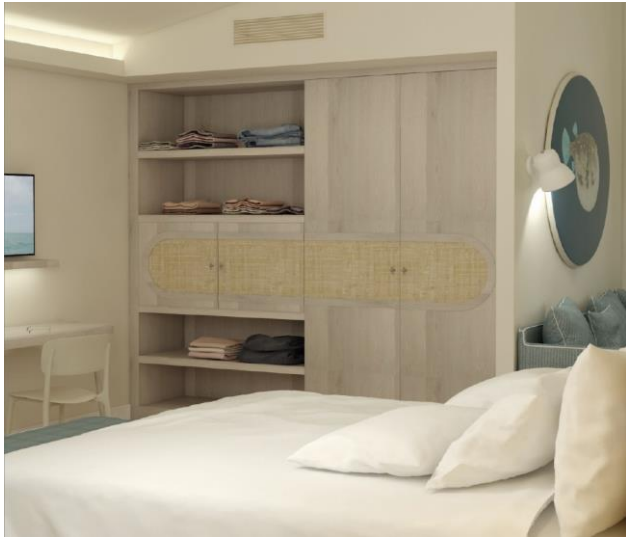
SUPERIOR DOUBLE – SUPERIOR TRIPLE 19 sqm / 21 sqm

No lift. The hotel has 112 rooms with telephone, hairdryer, TV Sat lcd 32, WI-FI, safe, air conditioning, mini fridge (drinks not included, on request with charge) and bathroom with shower. All rooms have an outdoor area equipped with drying rack.