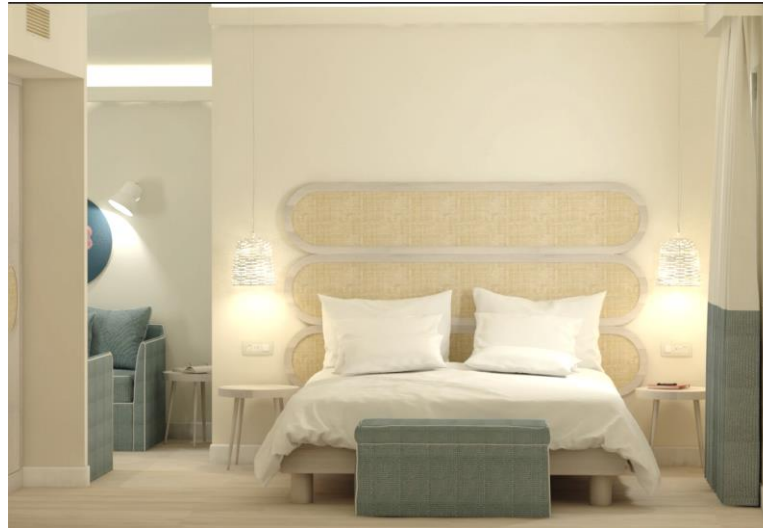
SUPERIOR TRIPLE WITH ADDED BED 29 sqm

The three bedded rooms have an area with the 3° bed next the main room, good livability.