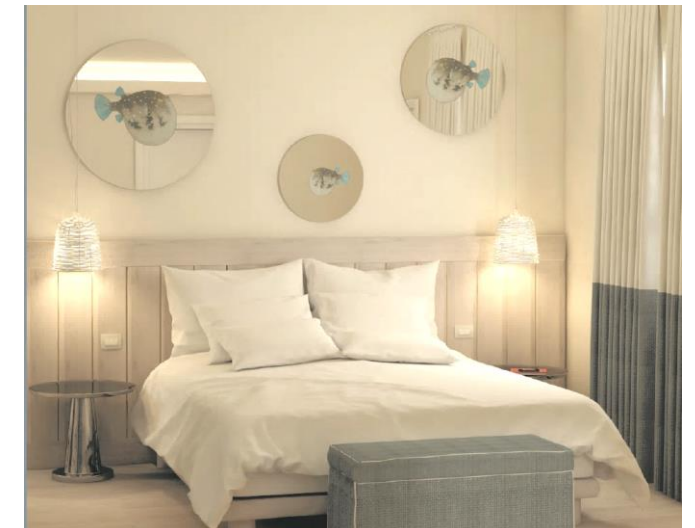
SUPERIOR FAMILY ROOM 38 sqm

Spacious and with 2 areas (not separated by a door), one with a double bed and the second with 2 single ones, are very comfortable with modern furniture, and soft and elegant colors.