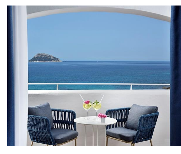
DELUXE ROOMS 22 m<sup>2</sup>

The <u>Beach Hotel</u>, is comfortably located closer to the beach, and with common areas and rooms renovated in 2019. In this area are located the Superior and the Superior Sea View Rooms with their own reception. Most of them with balcony.