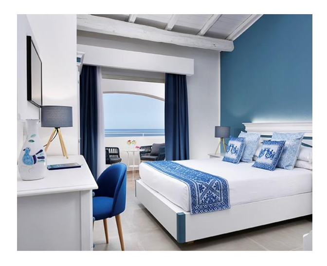
SUPERIOR & SUPERIOR SEA VIEW ROOMS* 22 m<sup>2</sup>

*Superior and Superior Sea View Rooms offer exclusive benefits: Mini Fridge (beverages included, not the restocking), Free Wi-Fi, Set coffee / tea maker, Daily change of beach towels (on request), Courtesy Set, Couverture, 20% discount on beauty treatments, reserved tables at Sos Aranzos restaurant and breakfast at Bellevue restaurant