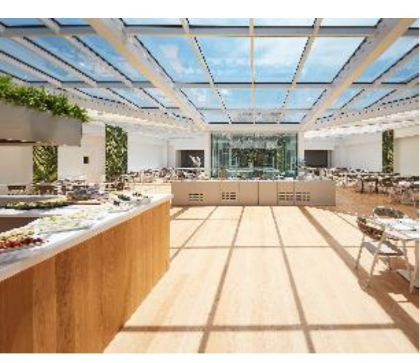
Main restaurant Il Baglio:

Open bar 10am to midnight offers soft drinks, wine selection, mineral water, beer, juices, tea, espresso, local liquors of the All Inclusive Ultra formula and 2 international liquors (gin and rum).